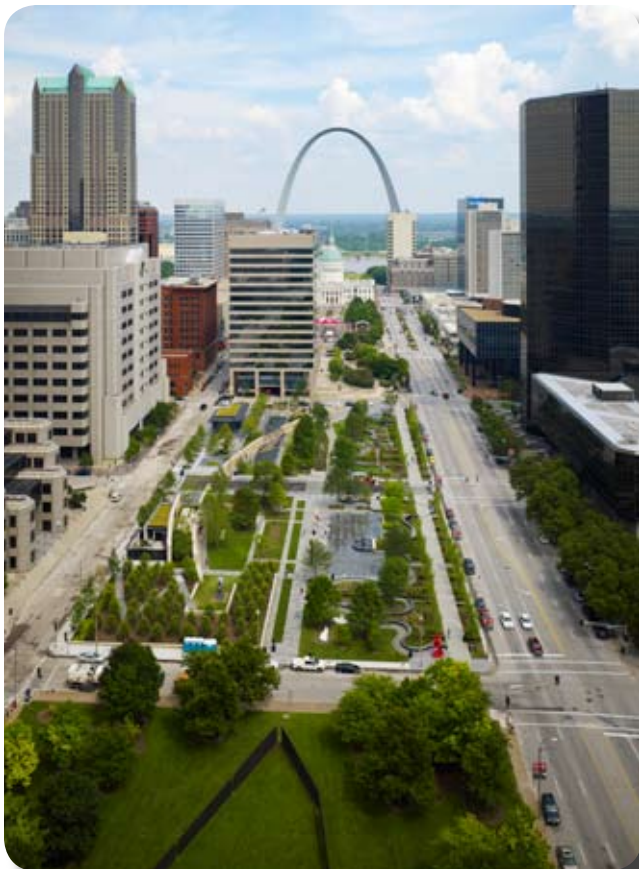
A new attraction in St Louis - the City Garden.

This year's theme "The Dynamics of Inequality," will call to mind a great deal of history.