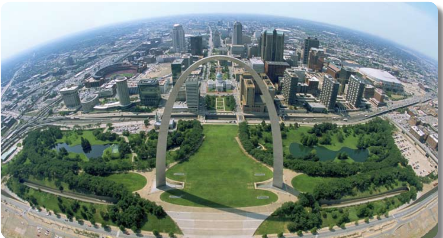
St Louis - the Gateway City.

Join your friends and colleagues at the Hilton St Louis at the Ballpark Thursday, March 24 - Sunday, March 27, for the 2011 MSS Annual Meeting!