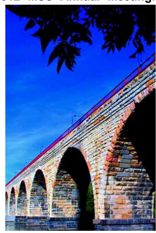
Minneapolis Stone Arch Bridge

RENEW YOUR MEMBERSHIP by using the form inside this packet; or renew with a credit card online at the MSS website, www.TheMSS.org.