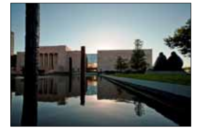
JOSLYN ART MUSEUM

Omahans are proud of what we've got: all the elements for a thriving fine arts scene - great galleries; an eclectic mix of artists; a large concentration of arts patrons; and a hip downtown. The <u>Joslyn Art Museum</u> opened to the public in 1931 and has a collection of 11,000 works representing artists and cultures from antiquity to the present. I can't possibly list all of the highlights, so check out their website for more: <a href="www.joslyn.org">www.joslyn.org</a>. You can take the free hotel shuttle to the museum and even admission is now free thanks to a grant from the Sherwood Foundation!