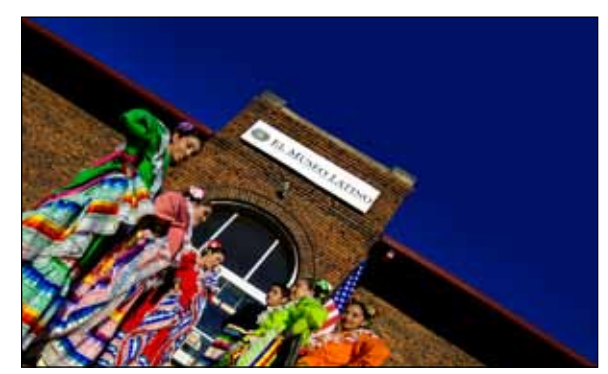
EL MUSEO LATINO, OMAHA

The Magic City tour focuses on the growth of South Omaha, which was founded in 1884 because of the creation of the Union Stockyards. Waves of immigrants flocked to the community to carve out a new life while working in the packinghouses, breweries, smelting plants, and other businesses that grew