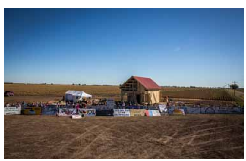
RENEWABLE ENERGY BARN, YORK, NE

an issue that has prompted more and more Nebraskans from a variety of backgrounds to create a new face of the environmental movement.